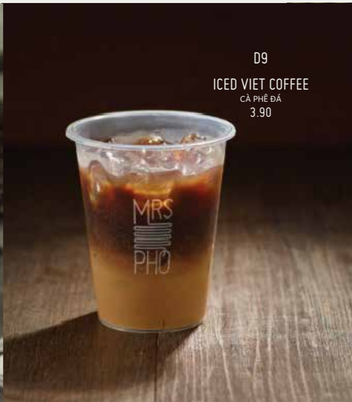
D9 ICED VIET COFFEE CÀ PHÊ ĐÁ 3.90