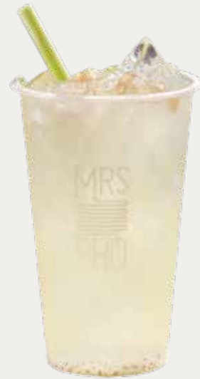
D10 LEMONGRASS TEA TRÀ SẢ 3.90