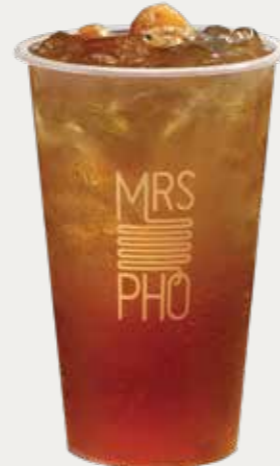
D12 SUMMER ICED TEA NƯỚC SÂM 3.90