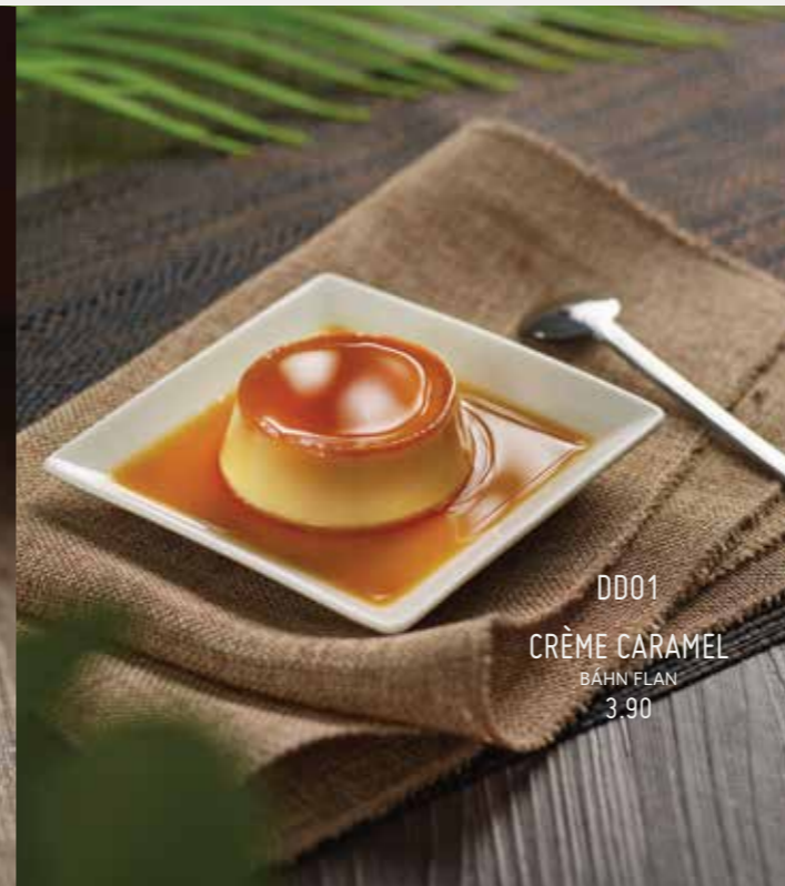
DD01 CRÈME CARAMEL BÁNH FLAN 3.90