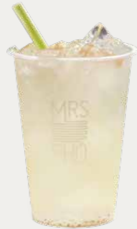
D10 ICED LEMONGRASS TRÀ SẢ 3.50