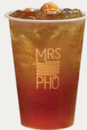
D12 SUMMER ICED TEA NƯỚC SÂM 3.80